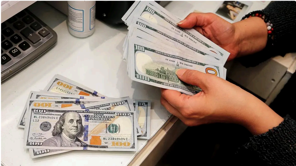
This funding will help Ecozen drive scale in its current businesses while furthering its position as a leader in sustainable technologies

Ecozen, a climate-smart technology solutions provider, has raised over $23 million in debt funding from responsAbility Investments AG, Northern Arc Capital Ltd, Maanaveeya Development & Finance Pvt Ltd, and others.